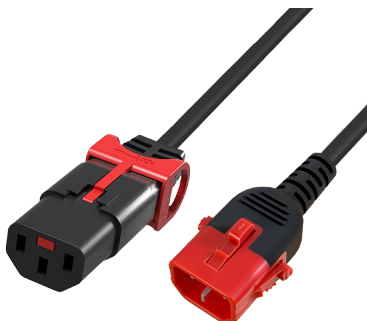
Locking functionality on both ends of the cord